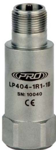
Figure 2: Dual output LP 400 series sensor LP404-1R1-1B

By having both signals in one sensor body preventive maintenance professionals can perform analysis after an alarm and potentially save thousands of dollars in downtime.