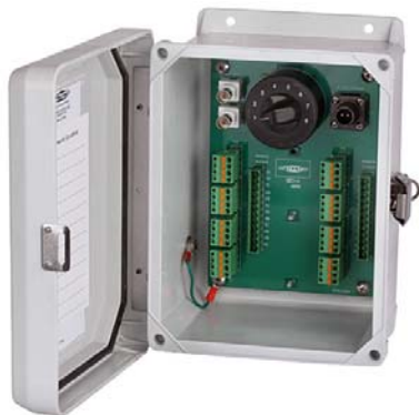
Figure 1: Dual output switchbox—sb142 series

One way that CTC offers this capability is through the use of Dual output LP sensors combined with the CTC DSB1000 series or