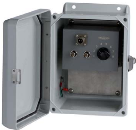
Figure 3: Dual output modular switchbox—DSB1000 series

Continuous monitoring using 4-20 mA signals directly proportional to vibration, scaled for output based on a low pass value and a high pass value can be a valuable tool for preventive maintenance professionals., enabling an alarm or triggering a shutdown should vibration exceed a certain preset level. Dynamic vibration signals enable analysis of machine defects so corrective actions can be taken. By having both signals in one sensor body preventive maintenance professionals can perform analysis after an alarm and potentially save thousands of dollars in downtime.